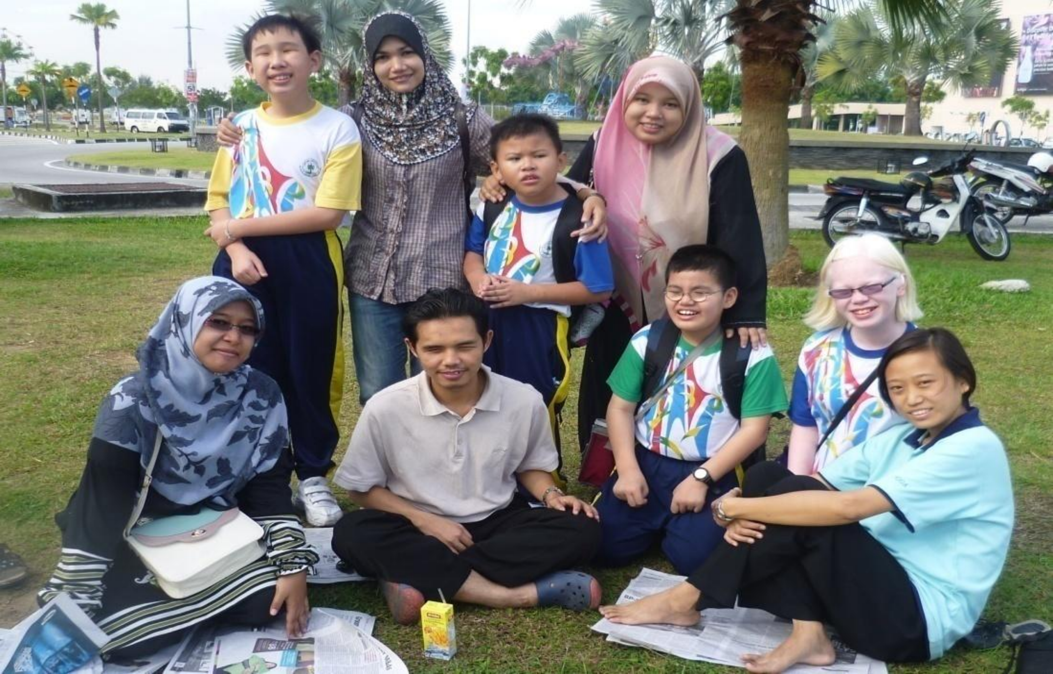
Inclusive Program (IP) for the Blind and Visually Impaired Children at Sekolah Kebangsaan Jalan Hamilton (SKJH), Georgetown, Penang.